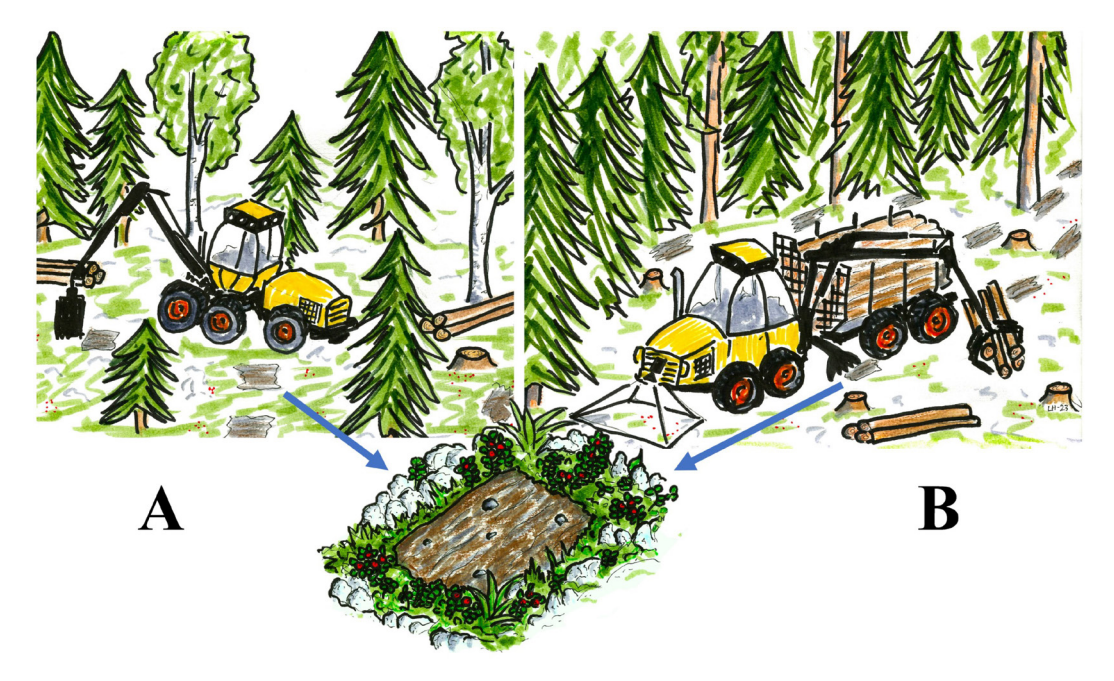
Fig. 4. A) Gentle, lichen-adapted mechanical site preparation (MSP) with a harvester in selection cutting; the MSP is performed using a simple scarifier mounted on the harvester head. B) Gentle, lichen-adapted MSP with a forwarder in gap cutting; the MSP is performed using image-based precision steering of the scarifying device to avoid lichen-rich areas. We postulate that the density of lichens and/or shelterwoods dictates whether harvester-based MSP (A) or forwarder-based MSP (B) is most suitable during shelterwood cutting. Drawings: Linnea Hansson, Skogforsk.

Our proposed solutions will help to develop site preparation technology that meet the needs of both the forest industry and reindeer herders. By lessening Nordic forestry's negative impact on lichen resources, reindeer husbandry would be strengthened, thereby helping the Nordic countries meet national and international obligations to protect indigenous peoples' rights. Precision MSP technology may even promote lichen growth in the long run if feathermosses and dwarf shrubs are removed during site preparation. Moreover, MSP aids pioneer tree species' regeneration (Grossnickle and Ivetic 2017), which many societal actors including reindeer herding communities wish to see more of in Sápmi (Fig. 3).