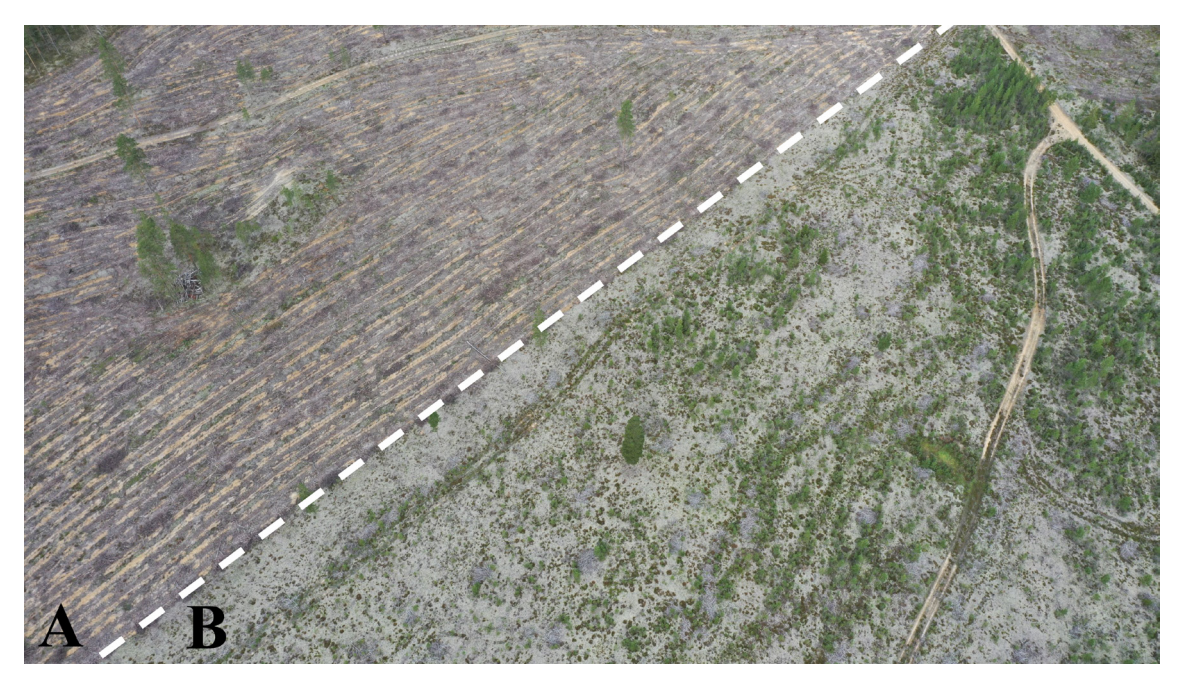
Fig. 2. A) Conventional, large-scale mechanical site preparation (MSP) has eradicated the ground lichen; B) gentle, lichen-adapted MSP has sustained the ground lichen cover, hence providing a food source for reindeer year-round.

Wildfire is the main natural determinant of successional stages of ground vegetation in boreal forests, and most northern Fennoscandia forests have been affected by recurrent fires (Zackrisson 1977; Niklasson and Granström 2000). However, during the last century, these forests have been subjected to fire suppression, which has dramatically reduced fire's impact on vegetation (Östlund et al. 1997). This absence of fire has resulted in an increase of feathermosses and dwarf shrubs (Wardle et al. 2004). Tree seedling establishment and growth is better in reindeer lichens than in feather mosses (Steijlen et al. 1995). Thus, there is a greater need for site preparation on microsites dominated by mosses than on lichen-rich sites and patches.