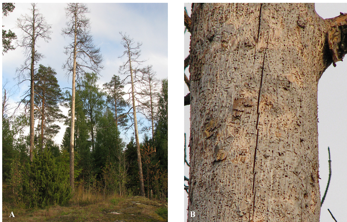
Fig. 1. A group of four large pines in rocky terrain colonized by Ips acuminatus and (one of the trees) Phaenops cyanea second summer after their death (A). Section of upper trunk entirely covered by I. acuminatus galleries (B). In trees where the bark has fallen off, it is easy to ascertain the presence of I. acuminatus based on its characteristic galleries using binoculars or a digital camera with a sufficient zoom (here about 15×).

Trees colonized by I. acuminatus often occurred as small groups, in which trees with different sizes had died at the same time during the same summer (as deduced by the degree of needle and bark loss, and by the composition of the associated insect assemblage). This also indicated that this species was the primary cause of death of the trees. Ips acuminatus possesses an aggregation pheromone. Individuals that manage to successfully attack a weakened tree release the pheromone, which will lead to the aggregation of many individuals to the same tree, and which can induce attacking also neighboring trees – with the result that trees will die in groups. The number of trees killed by I. acuminatus in one group was generally 1–12 trees (on the average 3 trees), but in one