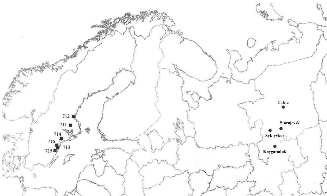
Fig. 1. Location of the lodgepole pine seed orchards and field trials.