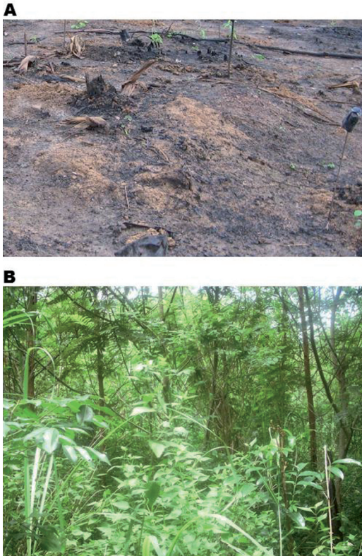
Fig. 1. Typical view of abandoned swidden fallow after burning (A) and establishment of mixed-species forest where P. dasyrachis appeared as emergent (B).

while inducing reductions in levels of exchangeable Al ions, which impair root growth (Ogawa and Okimori 2010). Biochar also enhances the physical properties of soil, e.g. by raising its porosity and water holding capacity, as well as the inoculation efficacy of root nodule bacteria and mycorrhizae (Warnock et al. 2007).