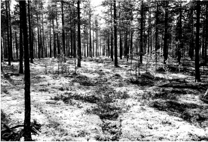
Fig. 4. On some dry sections not clearcut, the roadway of “Allmunvägen” is still visible, even though all the blazed trees are logged.

are gone and most of the trail’s surface is barely visible. This is mostly due to forestry activities, such as logging, scarification and road building. Other human activities have also destroyed parts of the trail, for example damming of the nearby river for a hydroelectric power station.