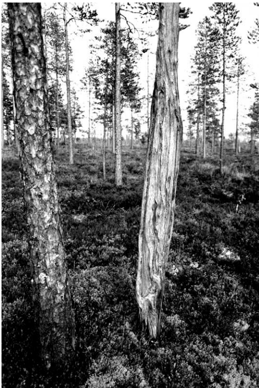
Fig. 3. Old snag ( Pinus sylvestris ), which repeatedly have been scarred, along “Allmunvägen” bridle path.

The scarred trees found were not evenly distributed along the investigated part of the trail (Fig. 1). Eighteen of the 82 old scarred trees were found on two separate 200 meter long sections (A and B in Fig. 1). This means that 22% of these trees were located on 2% of the investigated distance, making an average of 4.5 scarred trees per 100 meters on these sections.