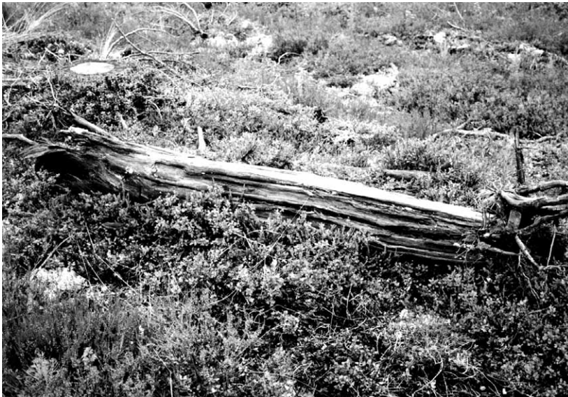
Fig. 6. Blazed tree ( Pinus sylvestris ), along the “Allmunvägen” which has been scarred three times, in the years 1778/79, 1788/89 and 1812/13. The tree was cut above the scars and saved during the felling of the adjacent trees, but was later runned down by scarification machinery.

trees, it is often later run over or damaged by the machinery involved in transport of logs, planting or scarification (Fig. 6).