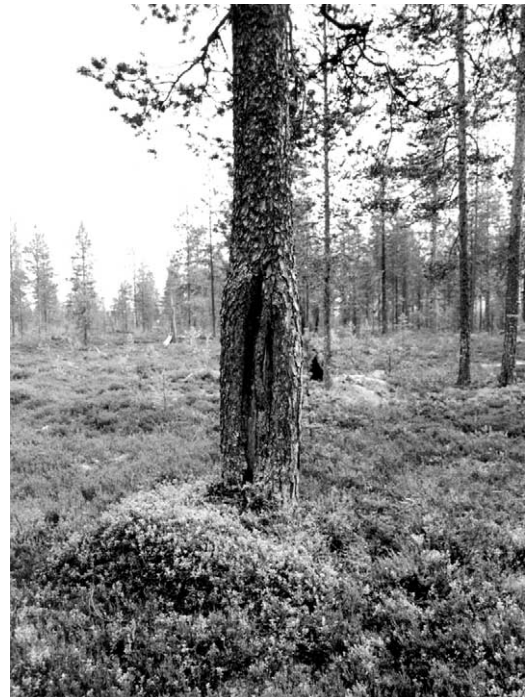
Fig. 5. Like ancient monuments, old pines ( Pinus sylvestris ) with blazes can be seen on a few remaining parts of the trail “Allmunvägen”. The multiple large scars, have caused characteristically large bulges on the tree trunks.

The scarred trees lining the trail are today the key to understanding the route. Without the aid of blazed trees one could not distinguish the main road from, for example, a crossing game trail. The frequency of blazed trees had to be sufficiently high that a stranger could follow the trail without getting lost. “ The road was designated with markings in the trees, that an unacquainted man in this wilderness would not lose his way. ”, says for example Daniel Herweghr, during his trip along the trail in 1763 (Table 1 C). But how many scarred trees were there on an ordinary forest trail? In theory the distance between each scarred tree should not exceed the traveller’s view at any given moment. The highest frequency we found in our study area was 4.5 blazed trees per 100 meter trail, equivalent to slightly more than 20 meters