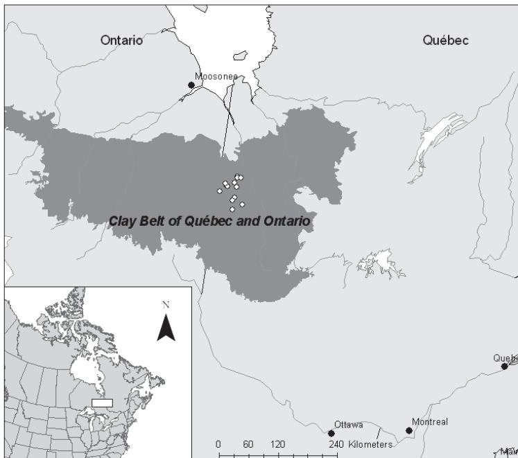
Fig. 1. Map of the Clay Belt of north-western Québec and north-eastern Ontario. Site locations are indicated by white circles. The location of the larger map in North America is indicated by the white box on the inset map.

The glacial lakes Barlow and Ojibway covered a significant portion of central North America during the last glacial period, the Wisconsinan glaciation that ended approximately 10 000 years ago in the study area (Vincent and Hardy 1977). As they were present on the landscape for 2500 years, a thick layer (10–60 m) of clay accumulated at the deeper portions of the lake bottom. These glaciolacustrine deposits remain today and form the Clay Belt of north-eastern Ontario and north-western Québec (Fig. 1) Vegetation in this region can be divided into two groups, black spruce ( Picea mariana Mill.)-feather moss ( Pleurozium schreberi (Brid.) Mitt.) forests in the north and balsam fir ( Abies balsamea (L.) Mill.), white birch ( Betula papyrifera Marsh.) mixed boreal forest in the south (Grondin 1996). The